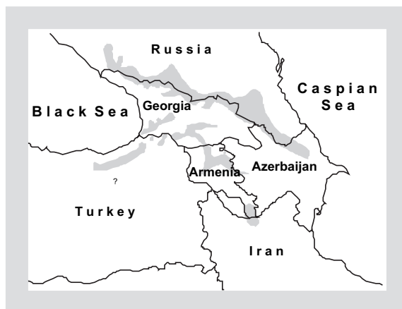
Figure 1. Distribution of the Caucasian black grouse (after Storch 2000).

The Caucasian black grouse is the only grouse species represented in Turkey. According to recent liter-